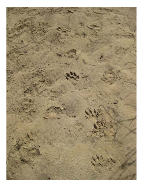
7-29-15: Raccoon Footprint