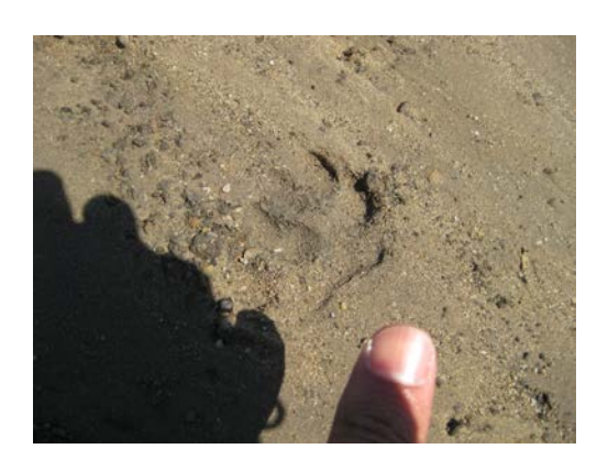
7-29-15: Coyote Footprint