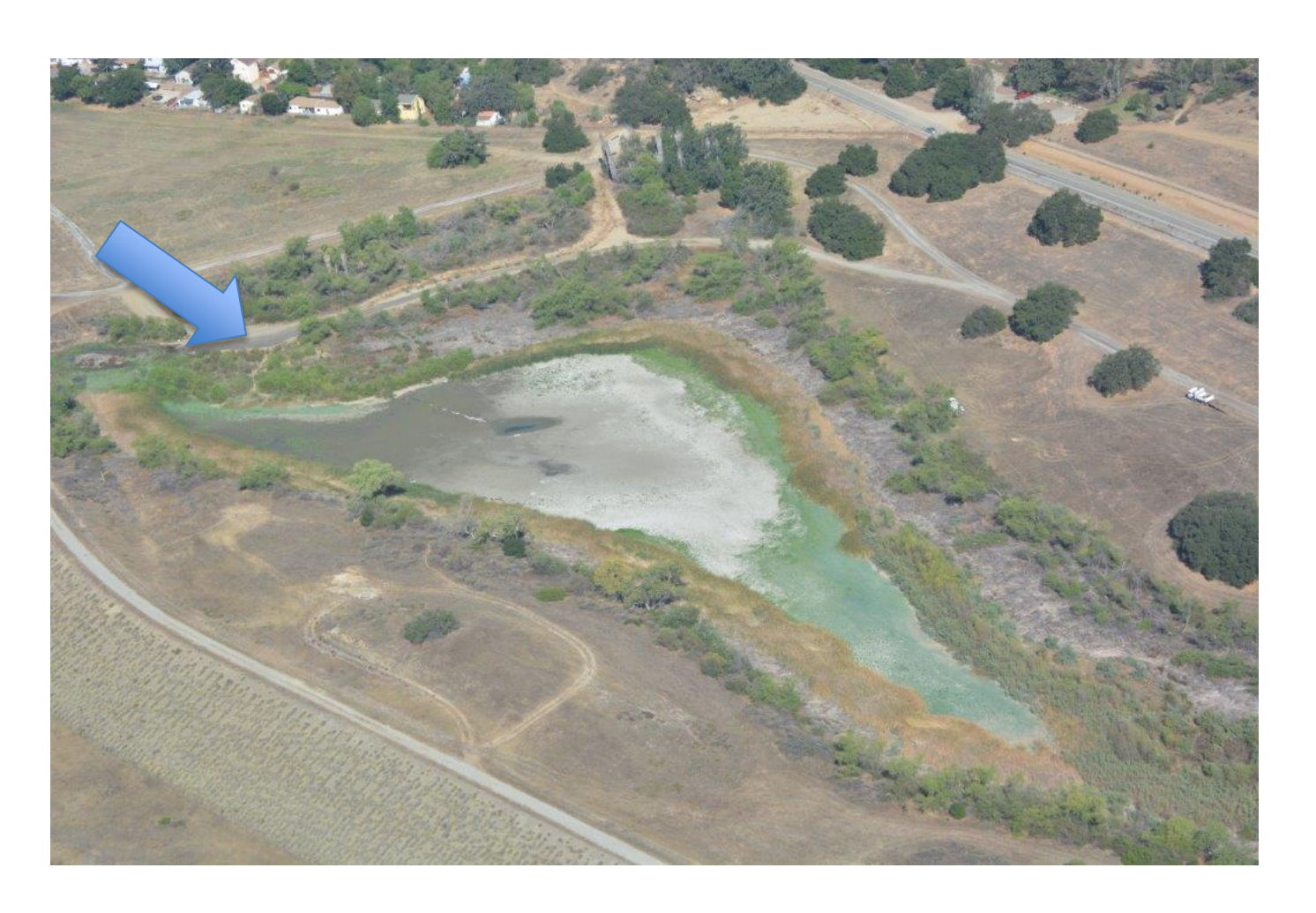
Water Truck Location