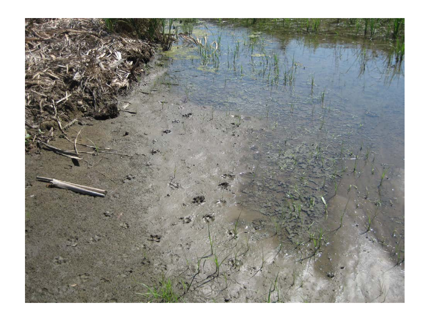
7-29-15: Raccoon Footprint