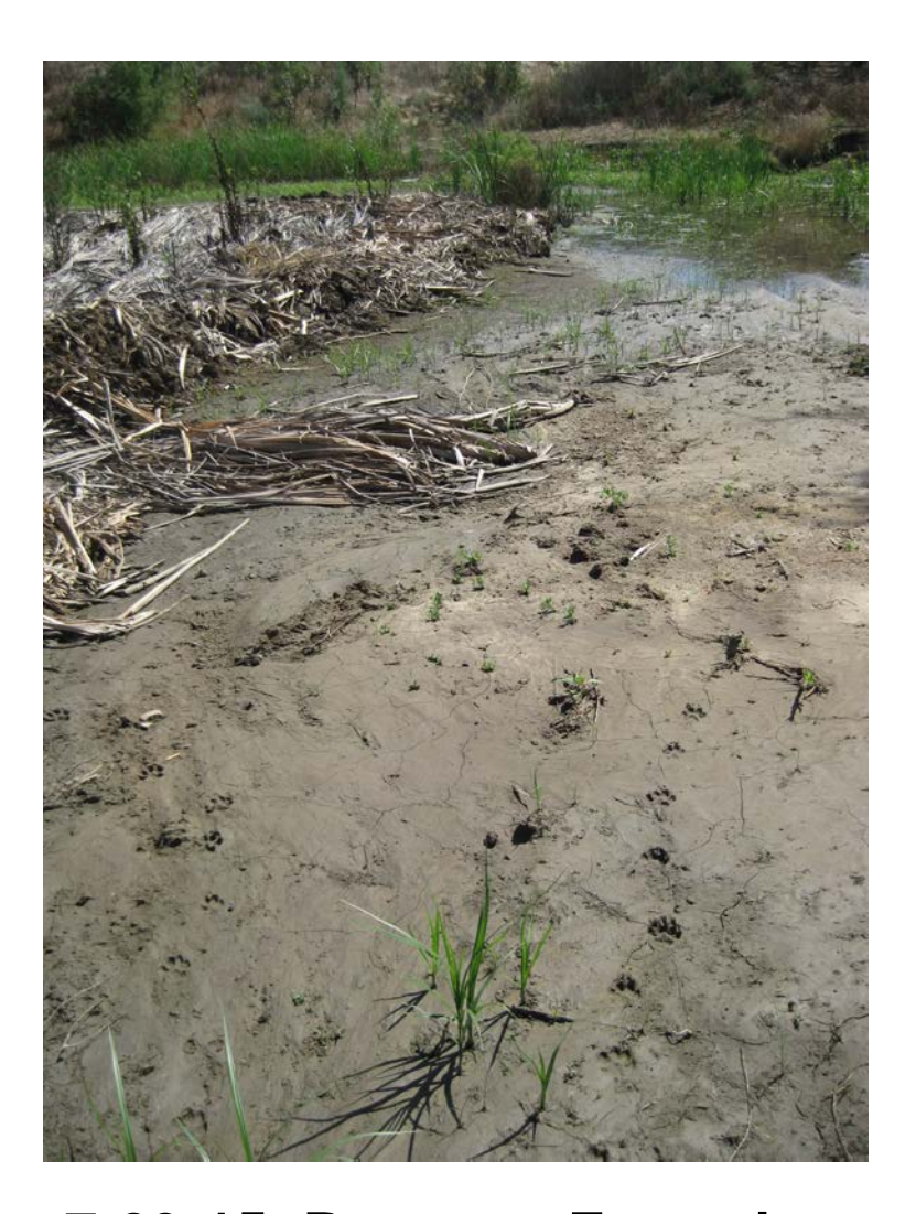
7-29-15: Raccoon Footprint