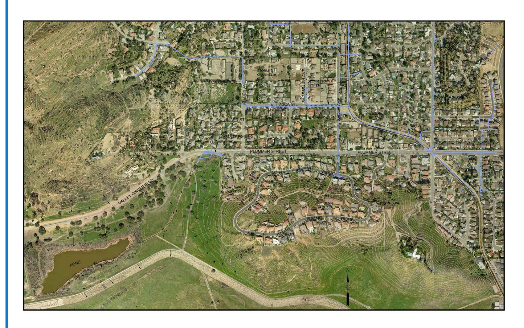
Map of Storm Drains and Runoff