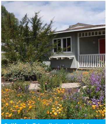
California Friendly® residential awn in Los Angeles neighborhood.